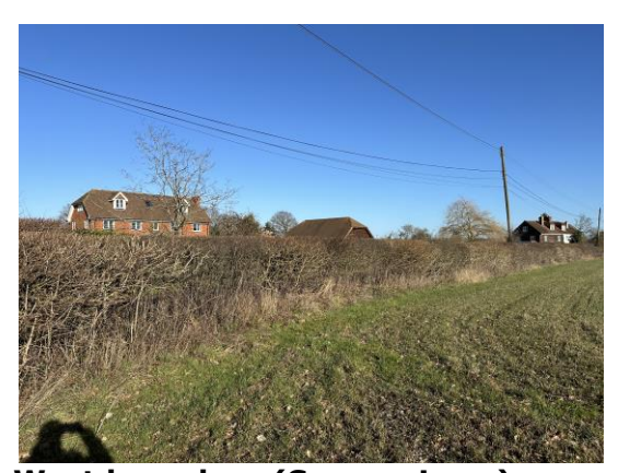
West boundary (Spenny Lane)

6.16 The change of use of the land to allow for dog walking would not significantly alter the appearance of the existing agricultural field, which is already grassland. Subject to the retention of the existing hedgerows, the proposal would sit acceptably within the rural landscape and therefore accord with Local Plan Polices SP17 and DM30.