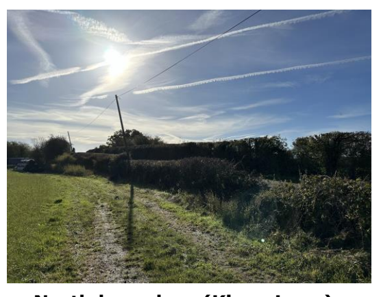
North boundary (Kings Lane)